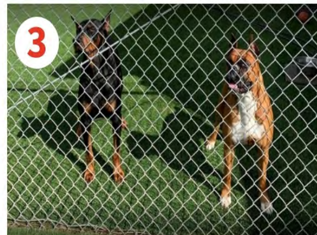
Fort Stewart Pet Boarding Facility