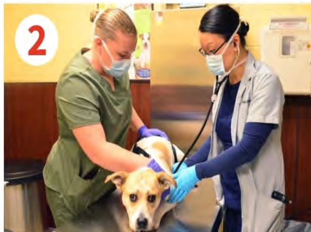
Fort Stewart Veterinary Treatment Facility