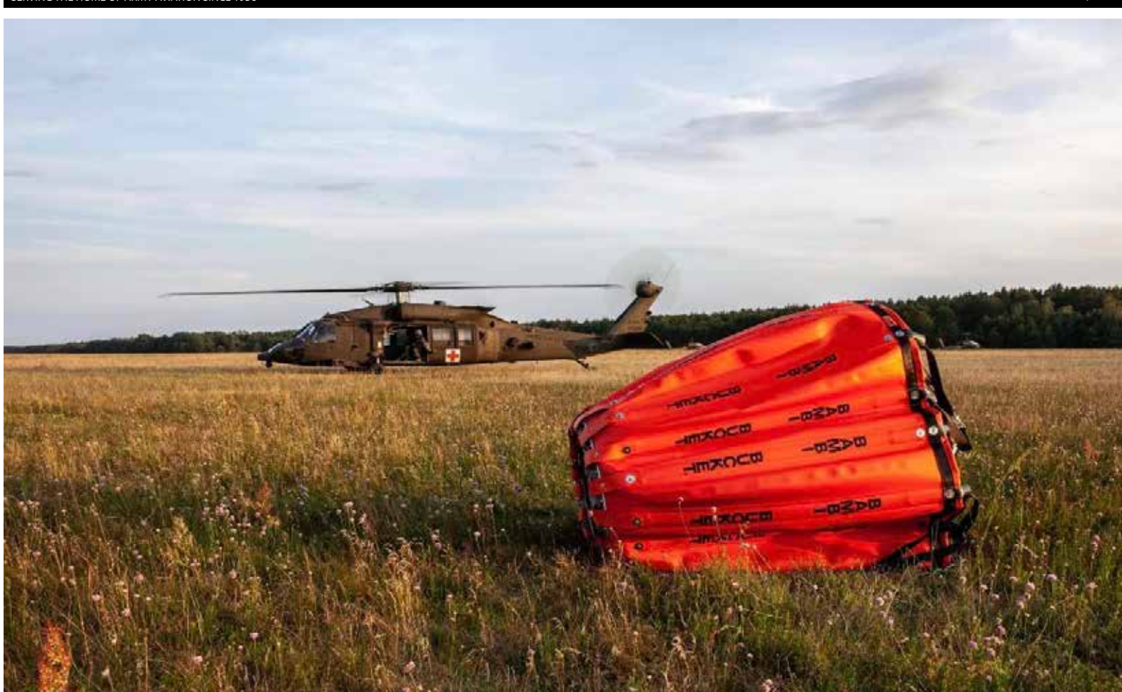
Soldiers from the 3rd Combat Aviation Brigade, 3rd Infantry Division practice bambi bucket aerial operations during the recent 3rd Squadron, 17th Cavalry Regiment aerial gunnery.