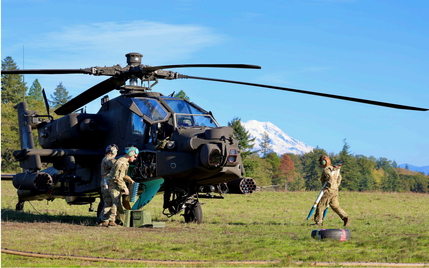
1-229th Attack Battalion, 16th Combat Aviation Brigade conducts aerial gunnery at Joint Base Lewis-McChord in October 2023. Teams of AH-64E Apache Helicopter pilots, 15Y- Armament/Electrical/Avionics Systems Repairs, 15R- Apache Maintainers, and 92F Petroleum Supply Specialists work together to execute the training that keeps them lethal.

VOLUME 73 • NUMBER 19 • NOVEMBER 30, 2023