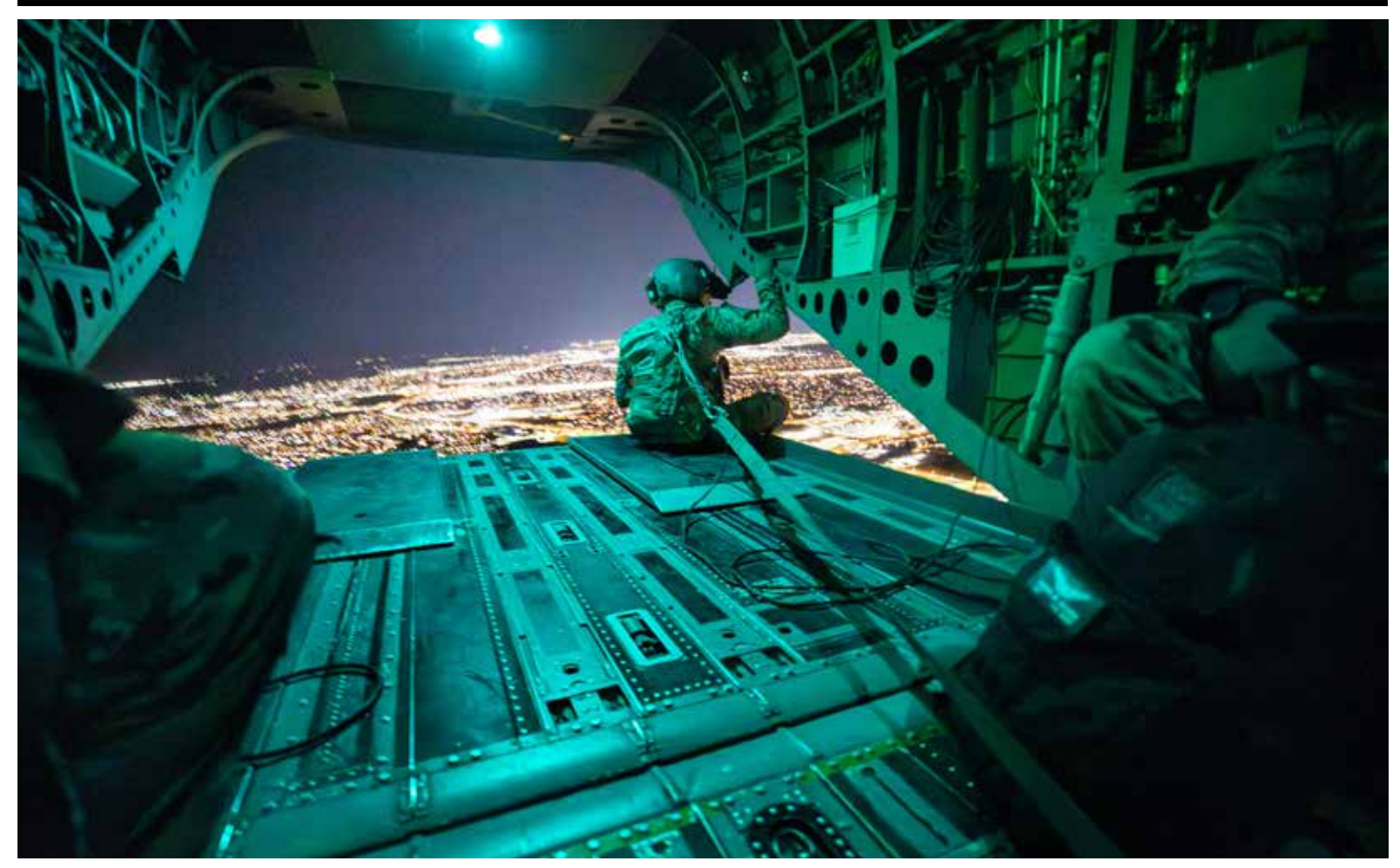
2023 Colorado National Guard Best Warrior competitors ride in a CH-47 Chinook Helicopter event at the Best Warrior competition, Fort Carson, Colorado, Oct. 20, 2023.

VOLUME 73 • NUMBER 17 • NOVEMBER 1, 2023