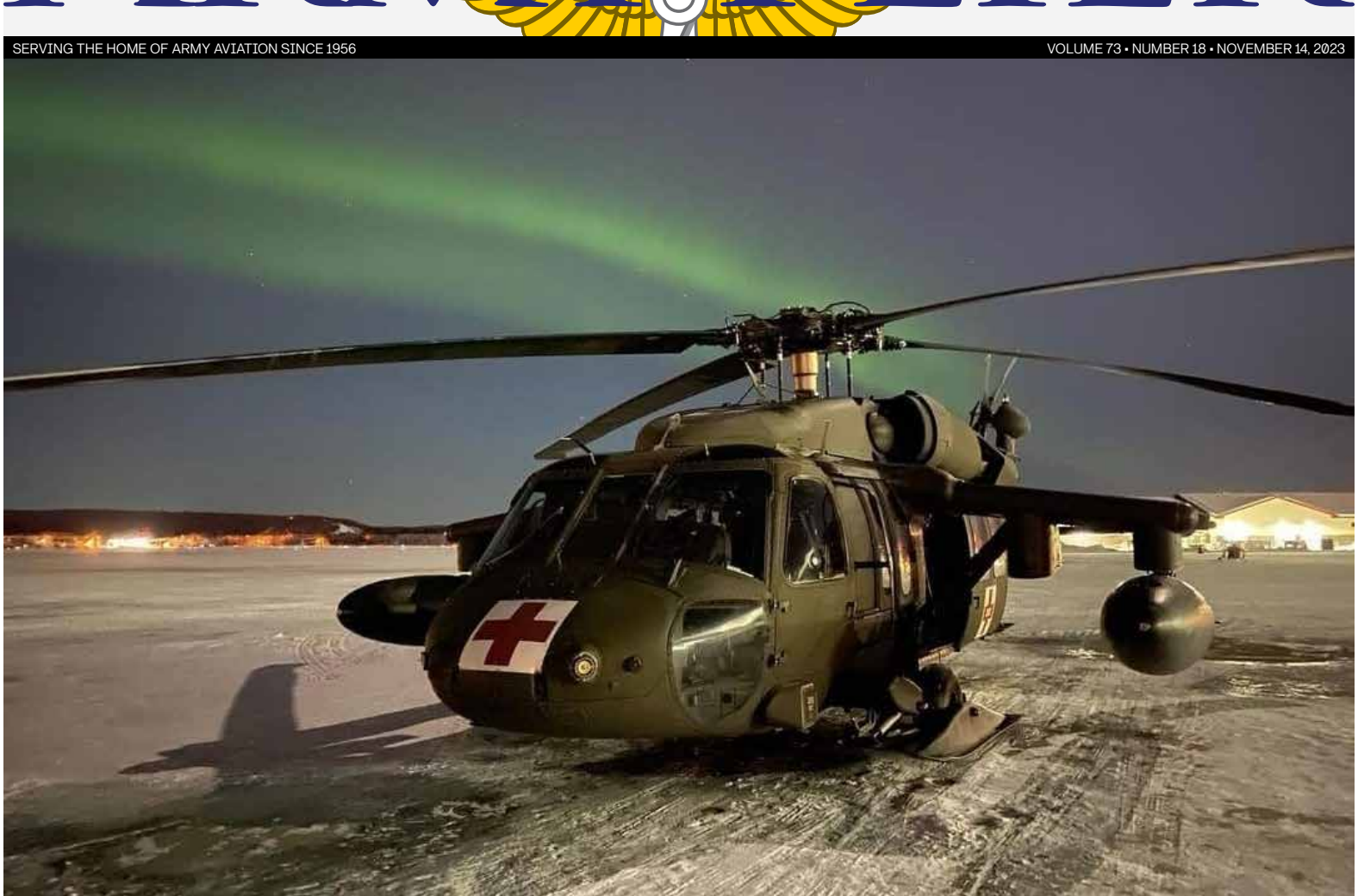
A UH60L Blackhawk helicopter belonging to Charlie Company, 1-52 General Support Aviation Battalion, 16th Combat Aviation Brigade, is parked on the airfield at Fort Wainwright while its crew prepares for a mission. The aurora borealis puts on a show overhead.