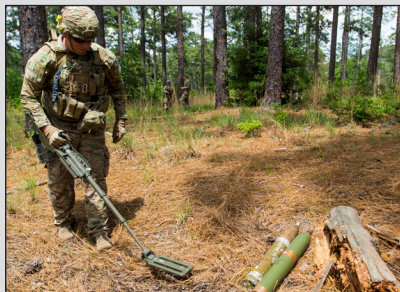
Explosive Ordnance Disposal Technician

Given the military's historical use of these installations and changes that have occurred over time in land use, the possibility of encountering a munition in an authorized hunting area is real. Given this potential, hunters are responsible for following the 3Rs (Recognize, Retreat, Report) of explosives safety.