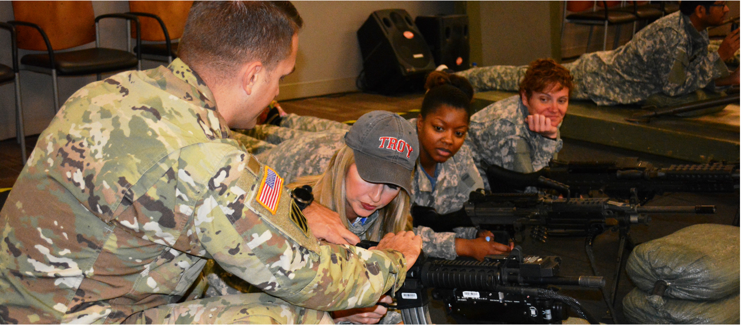
Young business professionals from the Wiregrass community learn about weapons Soldiers use as they participate in simulated scenarios in the Engagement Skills Trainer 2000 during Fort Rucker’s Community Outreach Day Dec.11.