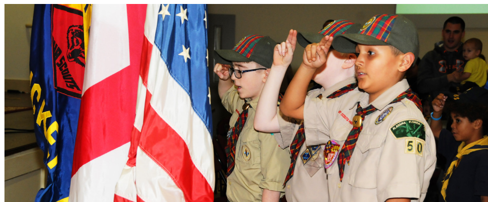
Scouts post the colors at the ceremony.

People interested in joining or getting involved with the Scouts can call the Alabama-Florida Council of the Boy Scouts of America, located in Dothan at 6108 W. Main Street, at 334-793-7882, according to Wood.