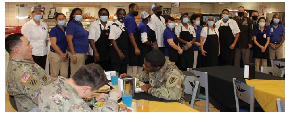
Members of the dining facility staff pose for a photo with members of the command group.