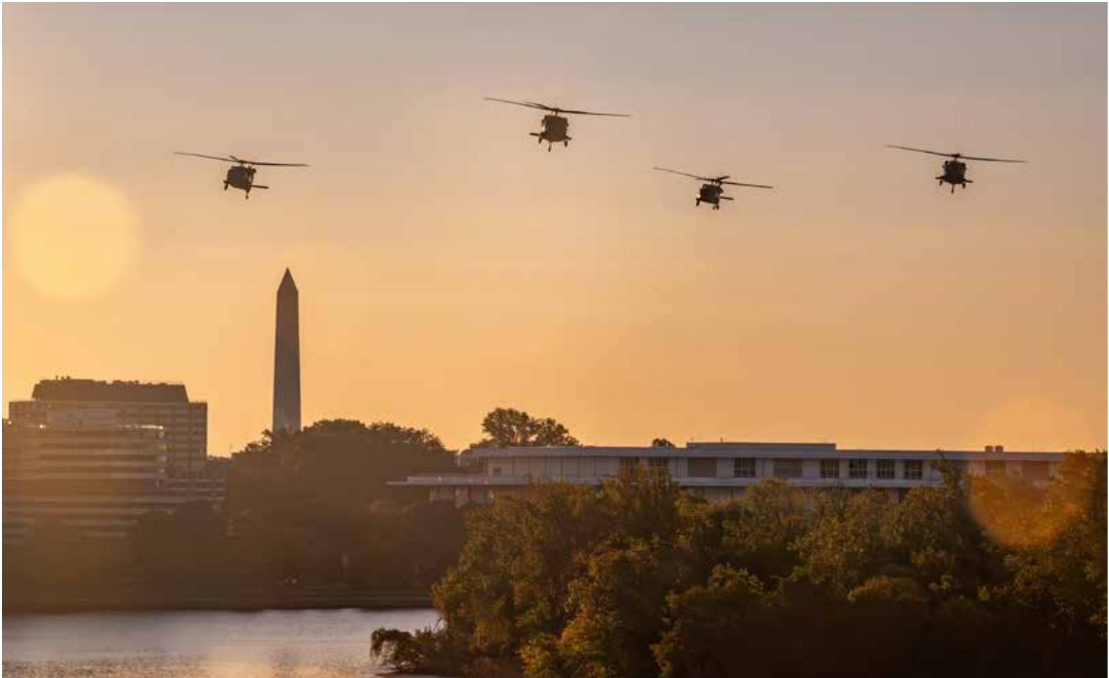
The 12th Army Aviation Battalion UH-60 Blackhawk helicopters fly in formation over the Potomac River in Washington during the 39th Annual Army Ten-Miler, Oct. 8, 2023.