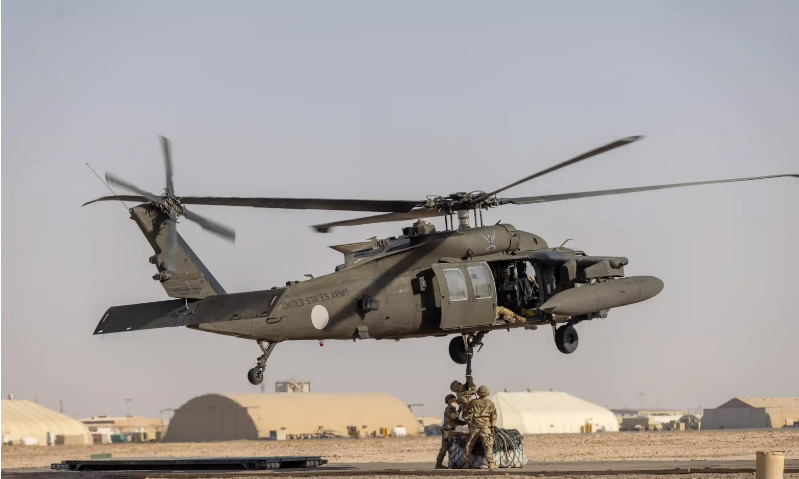
Soliders from Echo Company, 5th Battalion, 101st Aviation Regiment “Eagle Assault”, 101st Combat Aviation Brigade, 101st Airborne Division (Air Assault) conduct sling load operations in August 2025. We operate with precision, power, and purpose. In the Air Assault Division, excellence isn’t optional, it’s expected.