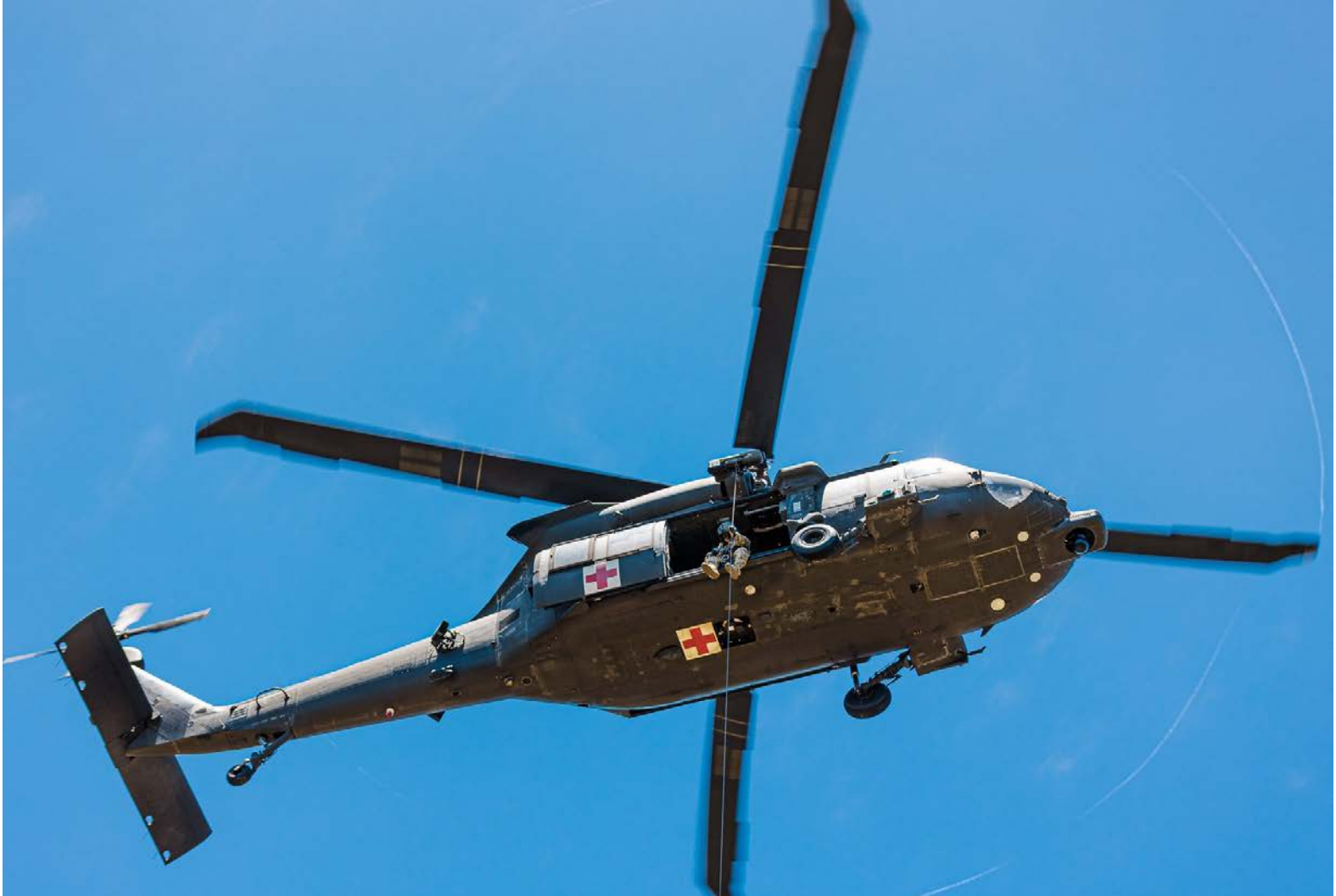
Soldiers from the 25th Combat Aviation Brigade, Wheeler Army Airfield, Hawaii, demonstrate the enhanced capabilities of hoist operations within MEDEVAC operations during a visit by the U.S. Army Aviation Center of Excellence Directorate of Evaluation and Standardization in August.

SERVING THE U.S. ARMY AVIATION CENTER OF EXCELLENCE AND THE FORT RUCKER COMMUNITY SINCE 1956 VOLUME 72 • NUMBER 12 • AUG. 18, 2022