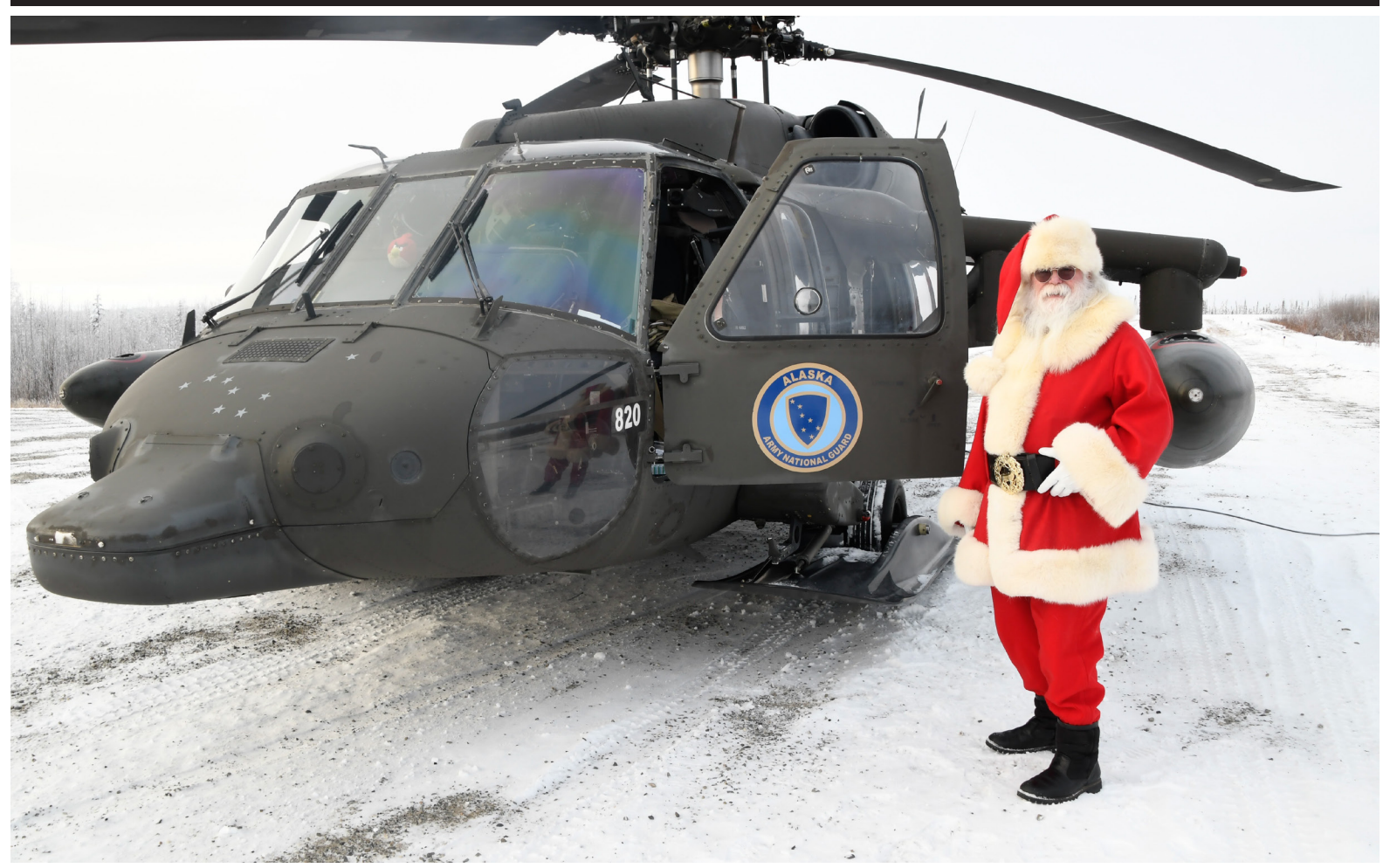
Santa Claus smiles after arriving in Circle, Alaska, on board an Alaska Army National Guard UH-60 Black Hawk to deliver gifts to children during Operation Santa Claus, Nov. 6, 2024. The Alaska National Guard's annual community outreach program has provided toys, backpacks and books to children in remote Alaskan communities since 1956.