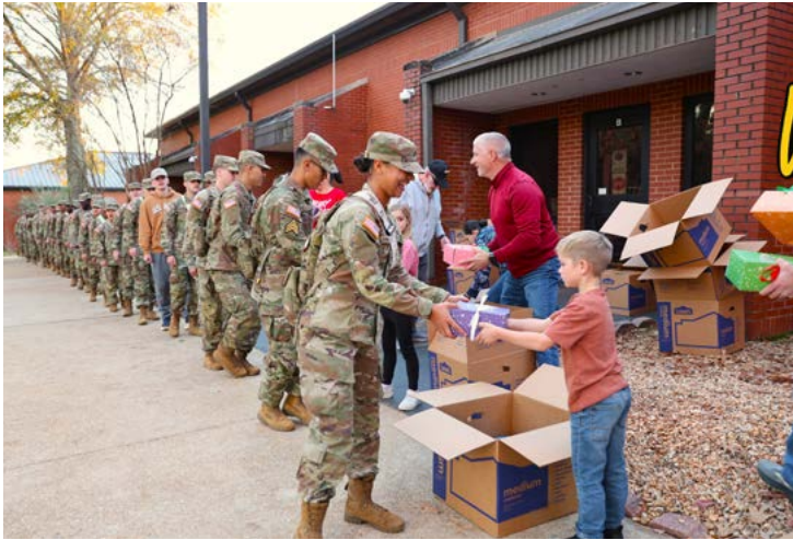
Volunteers from Heritage Church in Enterprise, Ala., provide boxes of snacks to AIT trainees to take with them on their travels just before they depart the installation for some well deserved time off with their families for the holidays at Fort Rucker, Ala., Dec. 19, 2025.