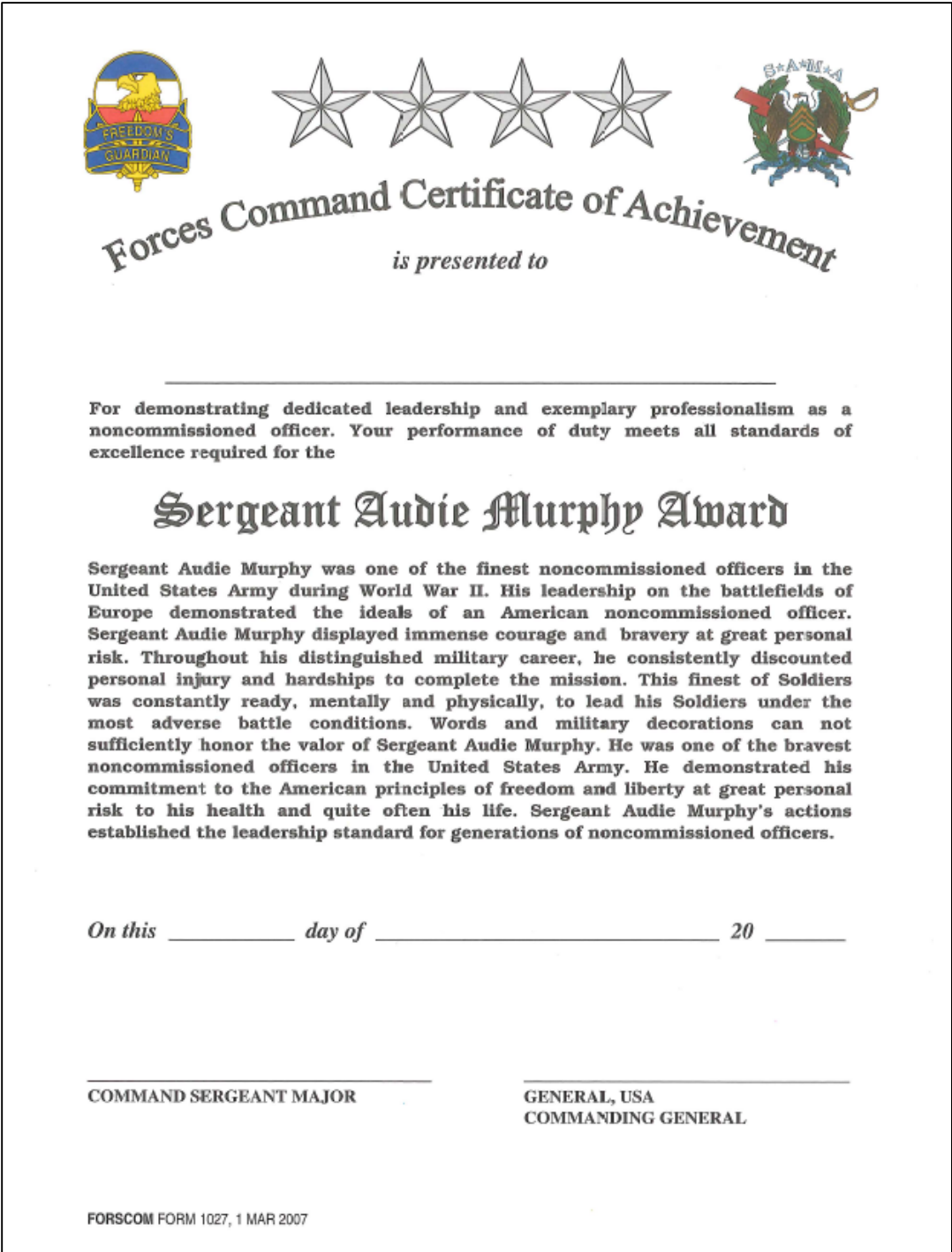
Figure 1-2. Forces Command Certificate of Achievement