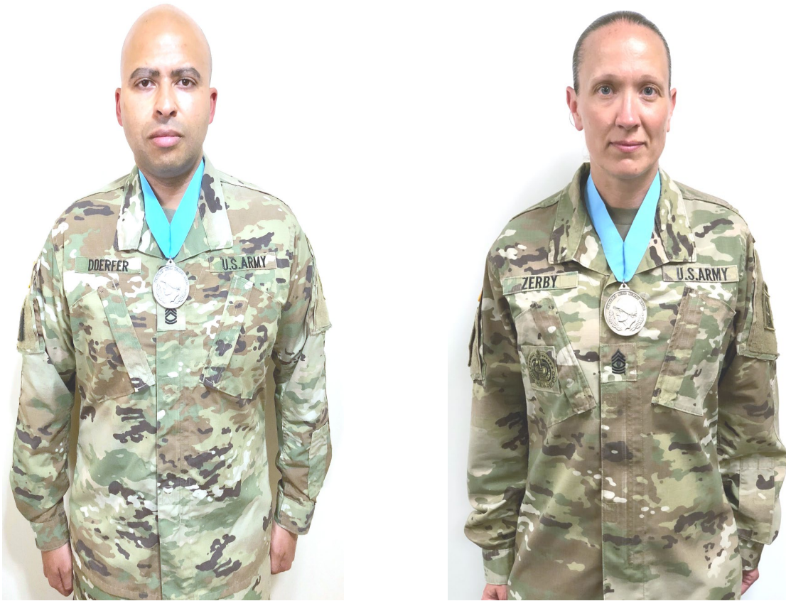
Figure 1-5: Sergeant Audie Murphy Medallion Army Combat Uniform (ACU) Wear and Appearance

Proper wear of the Sergeant Audie Murphy Award medallion. The proper wear of the SAMA medallion in ACUs. The neck ribbon is to be worn inside the collar of ACU coat. The medallion is to be suspended on the outside of the coat above the rank.