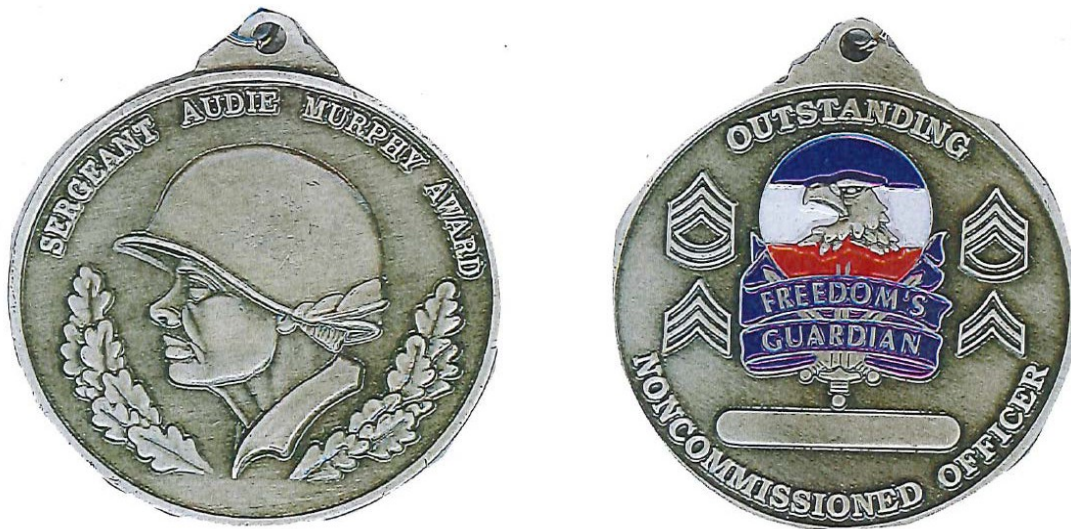
Figure 1-3. Sergeant Audie Murphy Award Medallion, front and back

The wear of the Sergeant Audie Murphy Award medallion will follow the guidelines described in AR 670-1, 15 September 2015, (chapter 22, para 9); and DA PAM 670-1, 31 March 2014, chapter 22, para 9.)