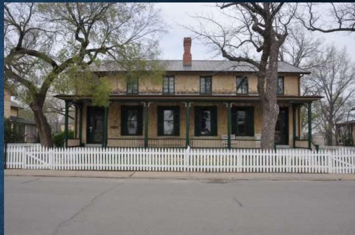
Custer House (24-A Sheridan Avenue)

The home surrounded by a white picket fence is Quarters 24-- also known as Custer House. This building was constructed in 1855 at a cost of $3500 and is the only surviving set of officers' quarters dating from the fort's establishment.