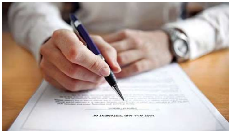
In 2022, Army Legal Assistance attorneys and paralegals assisted over 15,288 clients with their estate planning needs, drafting over 13,088 wills and 11,365 healthcare directives.

Our attorneys and paralegals are standing by and prepared to assist.