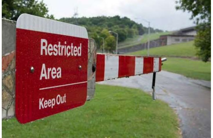
Retired Soldiers have a critical role to play when something doesn't look right. Antiterrorism Awareness iWATCH Army is a modern version of neighborhood watch focused on the threat of terrorist activity. It encourages people to identify and report suspicious behavior to military police or local law enforcement for investigation.

we expand our ability to protect Army communities. By understanding the indicators of potential terrorist activities and reporting suspicious behavior to military police or local law enforcement, Retired Soldiers serve as “sensors” (eyes and ears) to enhance and extend the protection posture of police and security forces.