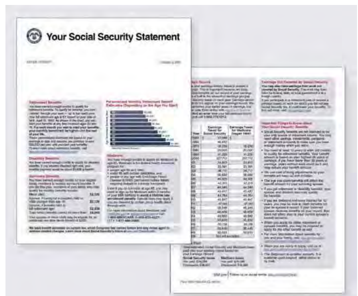
Using a my Social Security account, view your Social Security Statement to see estimates of future retirement, disability, and survivors benefits.