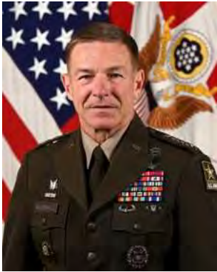
Gen. James C. McConville