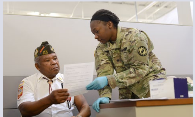
A Retired Soldier reviews medical information at the Mountain Post Service Center.

Find more info and resources on the TRICARE website ( https://www.tricare.mil/ ).