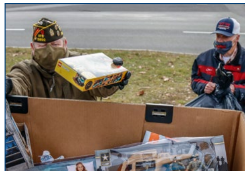
Veterans of Foreign Wars Toy Drive

What qualities should a VSO have? It should first be internally organized with a concise mission statement