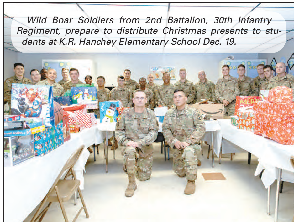
Wild Boar Soldiers from 2nd Battalion, 30th Infantry Regiment, prepare to distribute Christmas presents to students at K.R. Hanchey Elementary School Dec. 19.