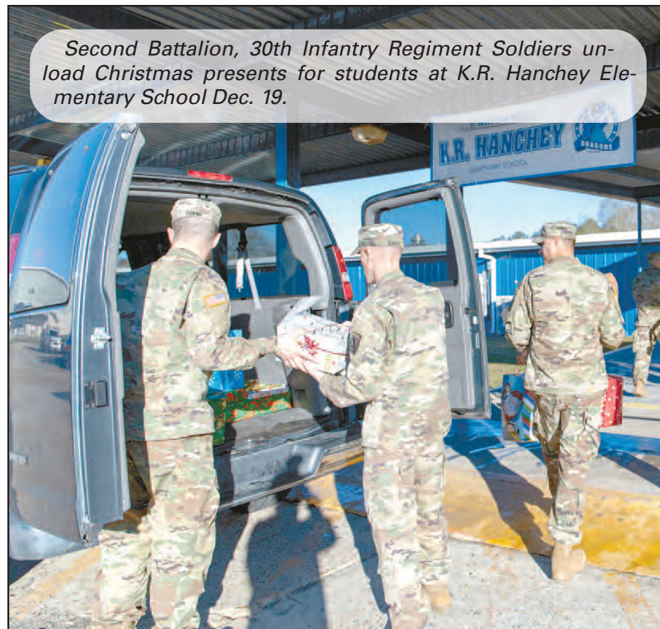
Second Battalion, 30th Infantry Regiment Soldiers unload Christmas presents for students at K.R. Hanchey Elementary School Dec. 19.