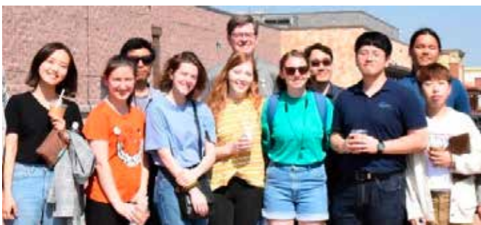
Students from the University of Idaho and Kyung-Hee University Seoul visit Camp Humphreys, May 23.