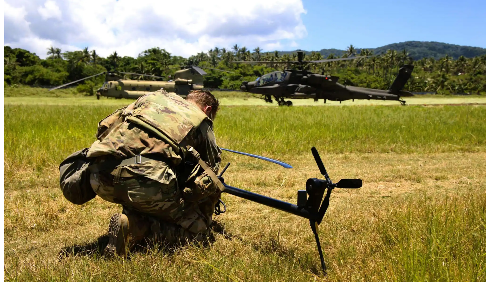
25th Combat Aviation Brigade Soldiersconduct a simulated air assault on Calayan Island using CH-47 Chinooks, AH-64 Apaches, and A-100 Gosht drones during Salaknib25 alongside the Armed Forces of the Philippines to shapren warfighting readiness and enhance lethality in the Indo-Pacific.