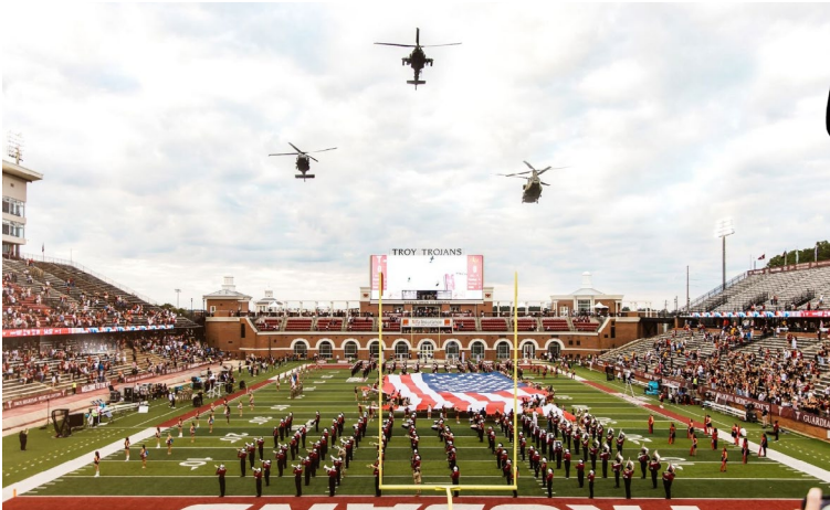
Fort Novosel soldiers and retirees participate in the annual Troy University military appreciation game Saturday, Sept. 28 at Veterans Memorial Stadium in Troy, Ala. The game is kicked-off with a flyover of an AH-64, UH-60 and a CH-47 from 110th Aviation Brigade.