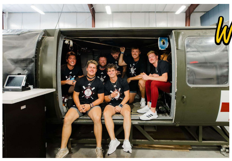
USAACE and Fort Novosel hosts the Troy University Baseball team Sept. 6, for a team building event called Operation Curve Ball.