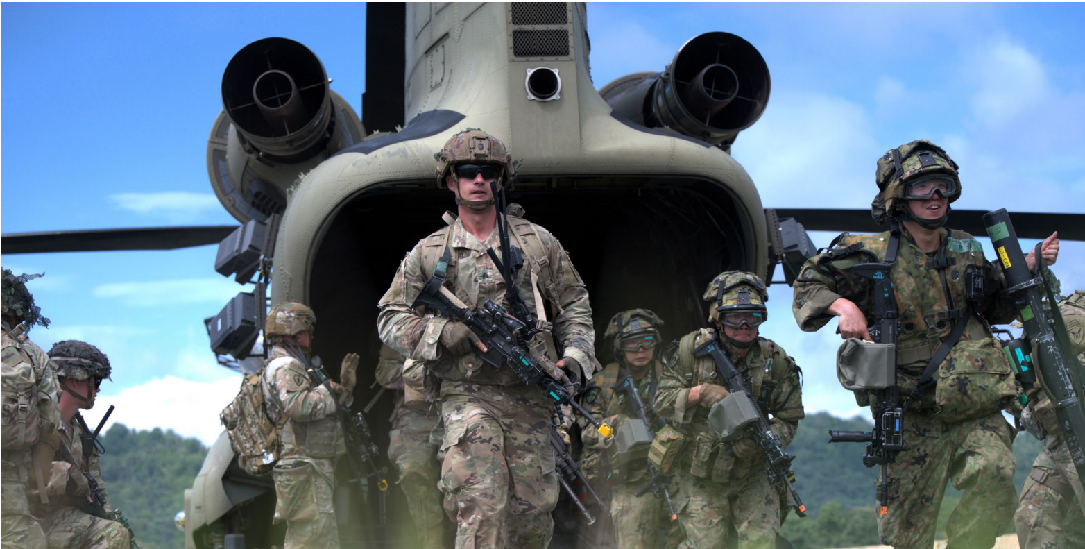
U.S. Soldiers from the 11th Airborne Division and the Japan Ground Self Defense Force (JGSDF) exit a CH-47 during sling load training at Aibano Training Area, Japan, July 29, 2024. Orient Shield 24 is a large-scale U.S. Army and Japan Ground Self-Defense Force (JGSDF) field exercise that focuses on converging U.S. Army Multi-Domain Operations and JGSDF Cross-Domain Operations through bilateral field training and live fire exercises that focus on a dynamic forward posture, enhancing tactical skills and interoperability.