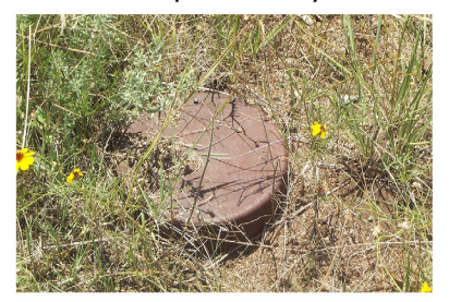
Find out how to protect yourself, your family, and your community at https://3Rs.mil.

Start the Day on the Right Foot and Follow the 3Rs (Recognize, Retreat, Report) of Explosives Safety.