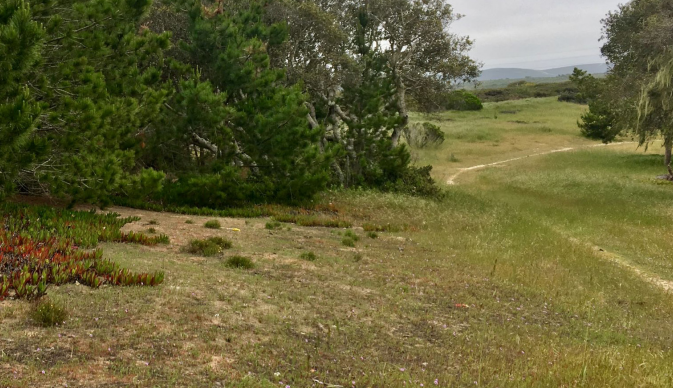
Monterey spineflower habitat, on Ord Military Community.