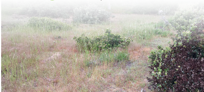
Monterey spineflower habitat on Ord Military Community.