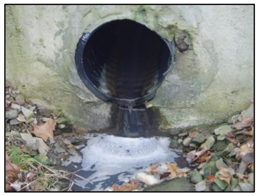
Lake County, Ohio

Learn to recognize illicit (unlawful) discharge from stormwater pipes, especially during dry weather. This could be a sign that there is a problem. Report your observations to the local department of public works.