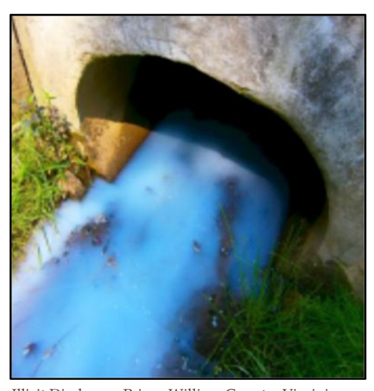
Illicit Discharge, Prince William County, Virginia

Identifying & Preventing Stormwater Pollution In Your Neighborhood