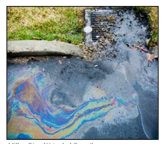
Millers River Watershed Council

sanitary sewer connections to storm sewer systems can make lakes and waterways unsafe for wading, swimming, and fish consumption. Eroded soil is a pollutant as well. It clouds the waterway and destroys the habitats of fish and plants.