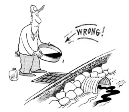
Solid Waste Institute of Northeast Oklahoma

Storm sewer systems do not treat polluted water at local wastewater treatment plants. Storm sewer systems transport rain water and everything in it directly to surrounding rivers, streams, lakes, and other bodies of water.