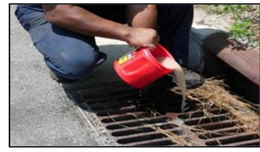
City of Portage, Michigan

The point in a storm sewer system where it empties into a body of water is a storm sewer outfall. It may be a pipe or ditch. If the outfall is flowing when there has been no recent rainfall, this may indicate an illicit discharge. Visible sewage waste, foul odor, suds or other evidence of contamination, are indicators that an illicit discharge is contaminating the storm sewer.