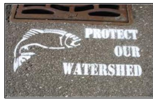
Macatawa Area Coordinating Council

<u>USEPA Stormwater Program</u> https://www.epa.gov/npdes/npdesstormwater-program