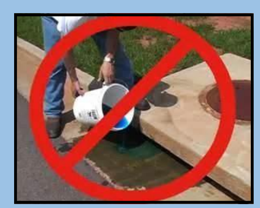
Identifying and Preventing Stormwater Pollution