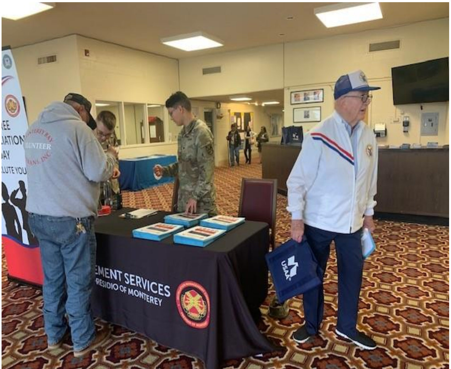
Active Duty Service members assisted Retirees at the RAD sign in table.

Looking forward to see you at this year's Retiree Appreciation Day!