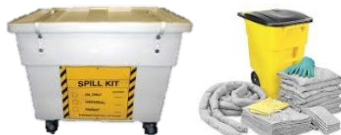
Located throughout hangars and inside of the used oil and fuel containers.