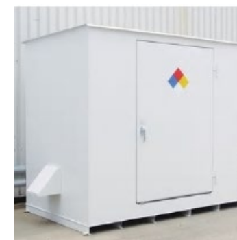
Satellite Accumulation Points are located outside of main hangars.