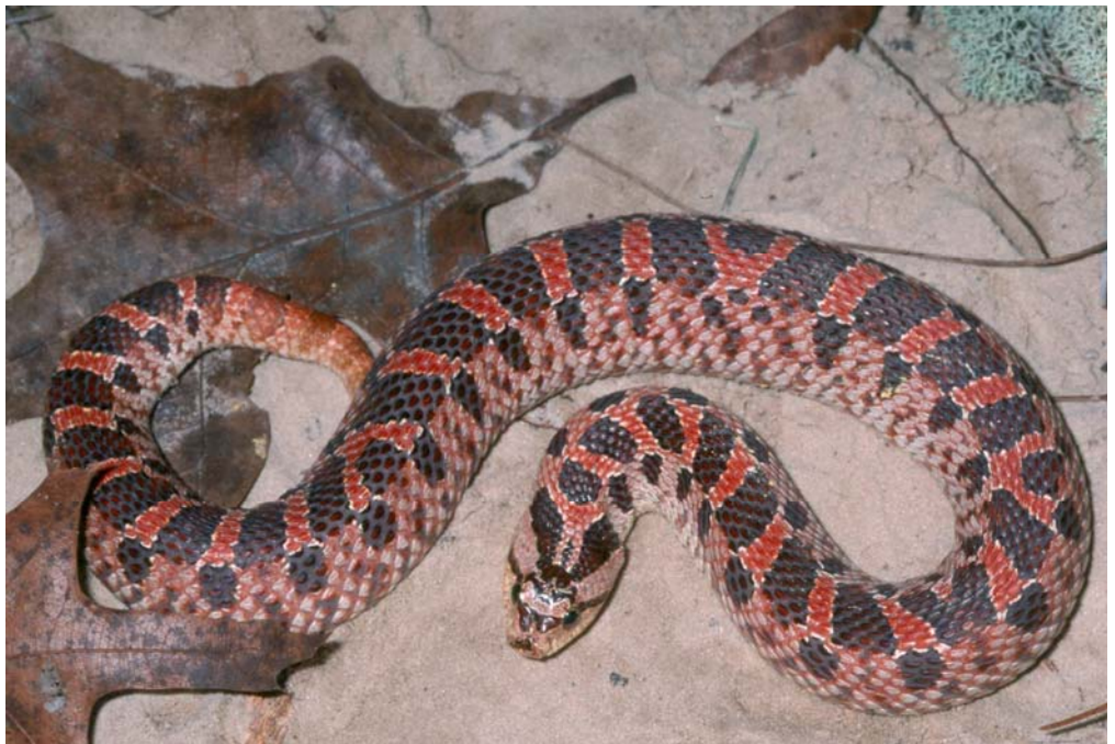
Southern hognose snake (Heterodon simus); Photo credit: Kevin Enge, Florida Fish and Wildlife Conservation Commission; Flicker—Creative Commons.

Southern hognose snakes were historically found in the Coastal Plain of the eastern United States from southern North Carolina to southern Mississippi and in most parts of Florida. Now, they are only found in scattered locations in South Carolina, North Carolina, Georgia, and Florida. Although both species of hognose snake in the Southeast prefer sandy areas, southern hognose snakes are found almost exclusively in sandhill, pine flatwood, and coastal dune habitats, and in the sand ridges of central Florida. Because of their fossorial habits, hognose snakes sometimes persist in suburban or agricultural areas with sandy soils.