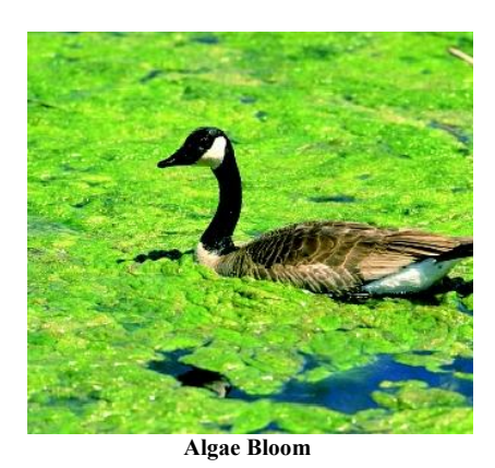
Phosphates found in soap can cause excess weeds and algae to grow. Excess algae smell bad, look bad, and harm water quality. As algae decay, the process uses up oxygen in the water, which can kill fish.

Washing one car may not seem like a problem, but collectively car washing activity can add up to big problems for local lakes, streams and wetlands. Pollution from car washing degrades water quality while also finding its way into sediments that impact aquatic life.