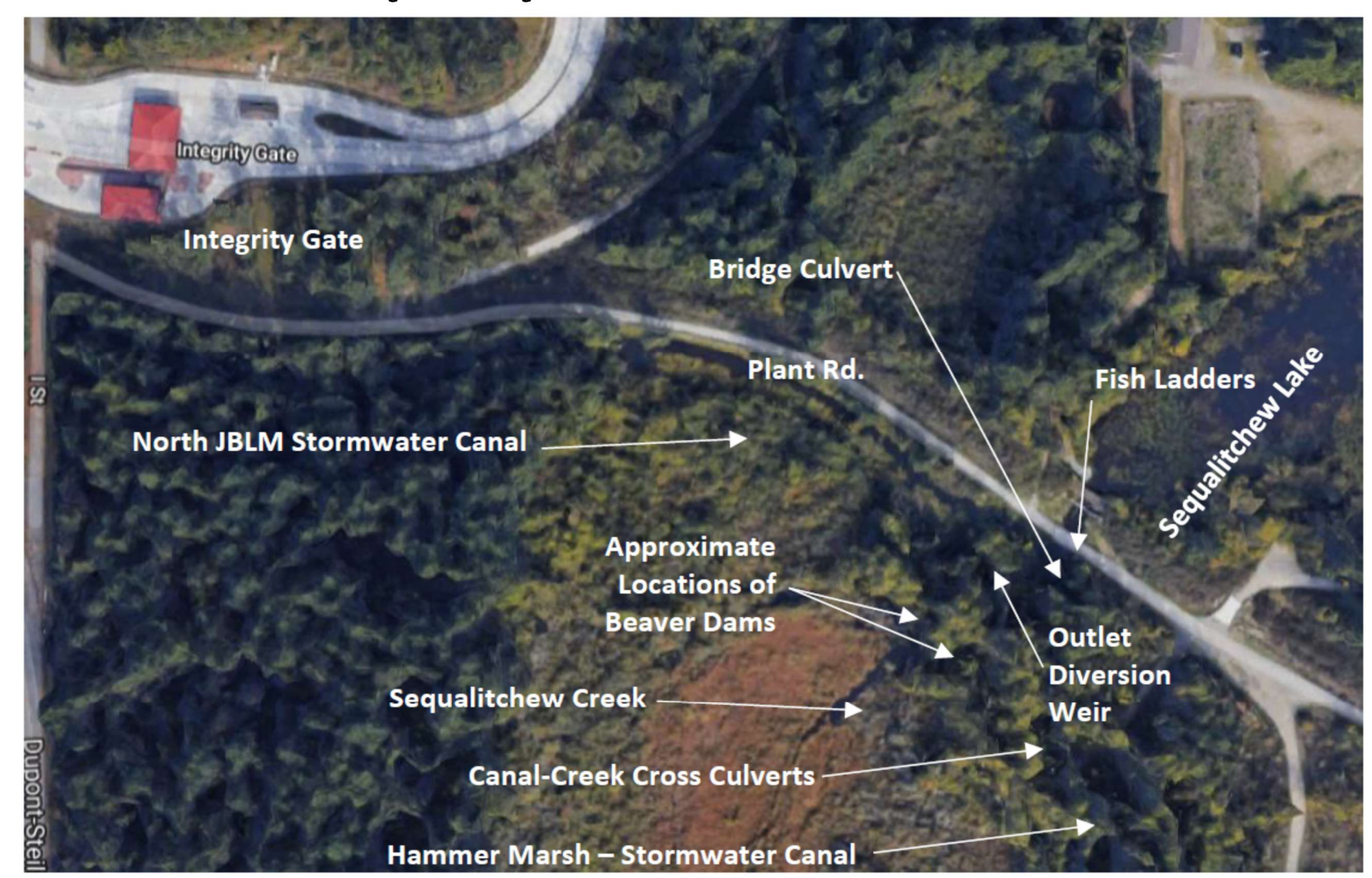
Figure 2: Existing Site Conditions