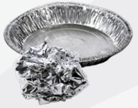
aluminum foil, pans and plates