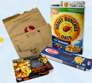
boxes and bags