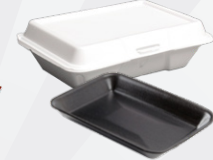
foam trays and containers