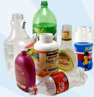
bottles (non-prescription ok)

Recycle plastics by shape. Ignore numbers/symbols on packaging.