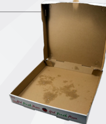
greasy pizza boxes