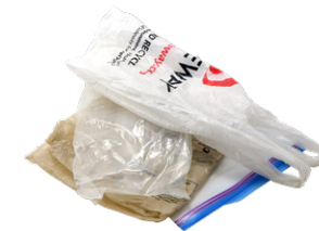
plastic bags and wrap (at participating grocery stores)