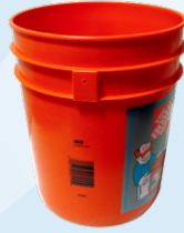
buckets (remove handle)