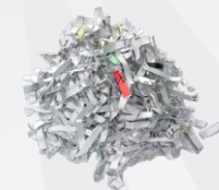
shredded paper (use a shred event)