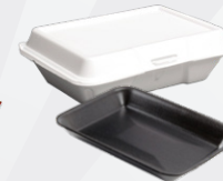
foam trays and containers