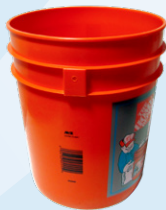
buckets (remove handle)