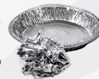
aluminum foil, pans and plates