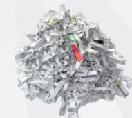
shredded paper (use a shred event)