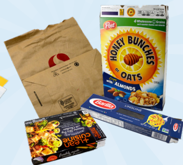
boxes and bags