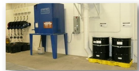
Unit Hazardous Waste Satellite Accumulation Areas