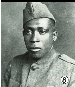
1) Fort Benning, Ga. – renamed as Fort Moore after Lt. Gen. Hal and Julia Moore; 2) Fort Bragg, N.C. – renamed as Fort Liberty after the value of liberty; 3) Fort Gordon, Ga. – renamed as Fort Eisenhower after General of the Army Dwight Eisenhower; 4) Fort A.P. Hill, Va. – renamed as Fort Walker after Dr. Mary Walker; 5) Fort Hood, Texas – renamed as Fort Cavazos after Gen. Richard Cavazos; 6) Fort Lee, Va. – renamed as Fort Gregg-Adams after Lt. Gen. Arthur Gregg and Lt. Col. Charity Adams; 7) Fort Pickett, Va. – renamed as Fort Barfoot after Tech. Sgt. Van T. Barfoot 8) Fort Polk, La. – renamed as Fort Johnson after Sgt. William Henry Johnson; 9) Fort Rucker, Ala. – renamed as Fort Novosel after Chief Warrant Officer 4 Michael J. Novosel, Sr.

proud to present a slate of names that reflect the courage, values, sacrifices and demographics of our military men and women.”