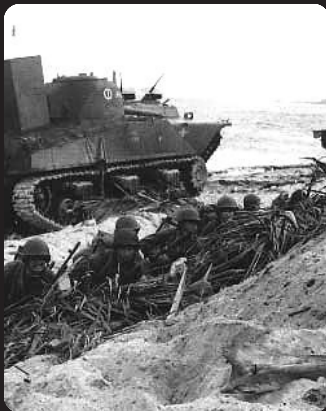
Above, the before and aftermath of battle during WWII, as Marines work to liberate Roi-Namur from enemy combatants.

Send announcements, community updates and event fliers to Kwajaleinhourglass@dyn-intl.com Wednesdays by 5 p.m.