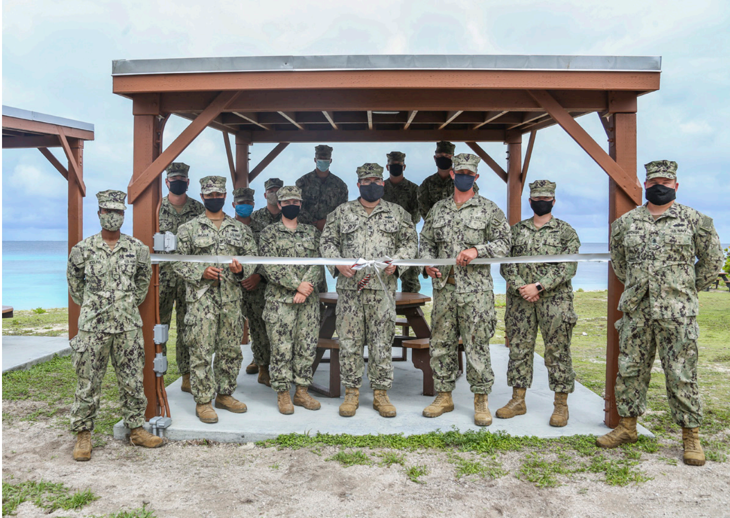
Members of Naval Mobile Construction Battalion 4, Detail Marshall Islands, participate in an April 16 ribbon-cutting ceremony to open new picnic shelters recently completed at Emon Beach on U.S. Army Garrison-Kwajalein Atoll.