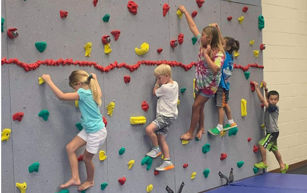
Kwajalein students enjoy rock climbing during an April session of School-Age Care Functional Fitness at George Seitz Elementary School. Call Central Registration at 5-2158 to learn more about SAC programming.