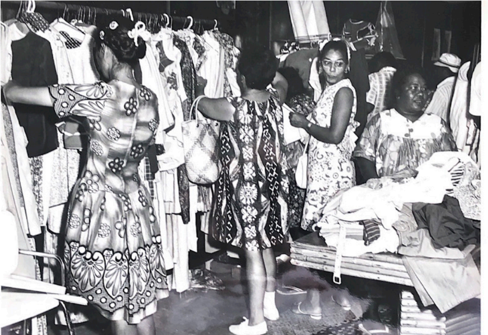
Shoppers check out deals on garments at the Bargain Bazaar in this historic Yokwe Yuk Welcome Club photo, circa 1973.

Interested in helping the YYWC continue its mission to support our host nation? Contact a YYWC club member to learn more about how you can volunteer to make a difference.