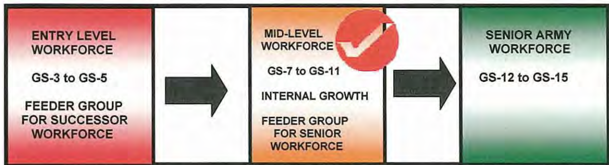
Figure 3 Categories for R&PD

Known factors at this time indicate that the future workforce will fall into three categories for recruitment and professional development (R&PD), as shown in figure 3 below.