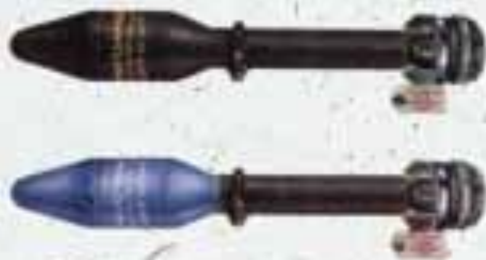
3.5-INCH ROCKETS (GROUND)