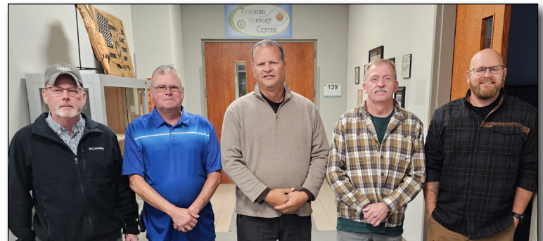
Team Training Support, DPTMS

The efforts of Fort Knox Training Support Center Team during Cadet Summer Training '24 ensured that ROTC Cadets received essential training and evaluation. The team demonstrated innovation by leveraging Soldier Monitoring Systems from three installations at no additional cost, working directly with the Army Training Support Center to secure additional training devices for Basic Rifle Marksmanship Training, making functional adjustments to the Night Infiltration Course and more.