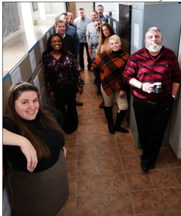
DPW Master Planning Division