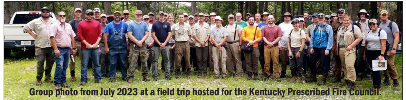
Group photo from July 2023 at a field trip hosted for the Kentucky Prescribed Fire Council.