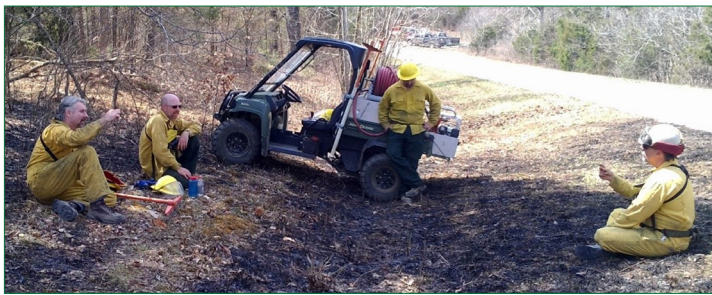
Brandenburg (right) conducts a post burn briefing with members of the fire crew.

It would probably be an offshore fishing trip to Panama or Western Mexico.