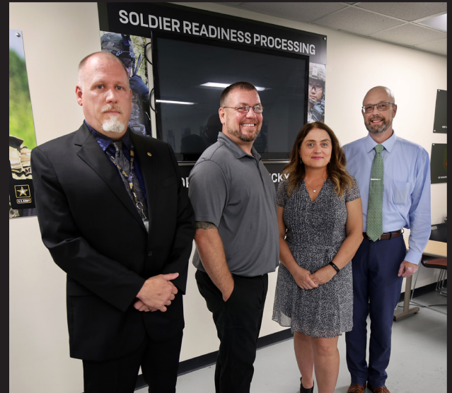
SRP Plans & Ops, DHR

As members of SRP Plans and Ops planned, coordinated and executed the smooth mobilization and predeployment of 135th Expeditionary Sustainment Command from Alabama to an overseas role, they were given the hasty task of preparing V Corps for deployment to Europe. These efforts involved building and maintaining relationships among multiple agencies to successfully prepare both units for deployment.