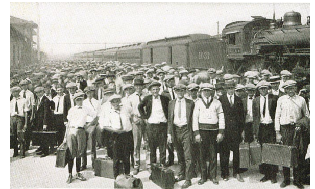
CMTC Candidates arriving at Camp Knox. From the CMTC 1923 yearbook, The Mess Kit .