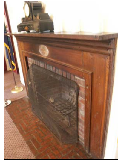
Mantel built by Thomas Lincoln, located in the Leaders Club at Ft. Knox

their daughter, Mary Crume, complete the three generations of Lincoln’s buried side by side. Several generations of a family buried together indicates long time residence in the area.