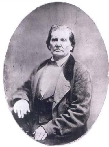
Thomas Lincoln, a Traditional Portrait Abraham Lincoln Library and Museum Lincoln Memorial University

In Indiana, the Lincolns cleared the land to make a new home in the wilderness. In 1818, Nancy became ill with the “milk sickness” and died. The following year Thomas returned to Elizabethtown to marry widow Sarah Bush Johnston and brought her and her children back to Indiana. Tragedy struck the family again when Abraham’s sister died in 1828 at the age of 21. The Lincolns moved to Illinois in 1830, where Thomas and Sarah would spend the rest of their life. He passed away on January 17, 1851 and is buried with his wife in Coles County, Illinois.