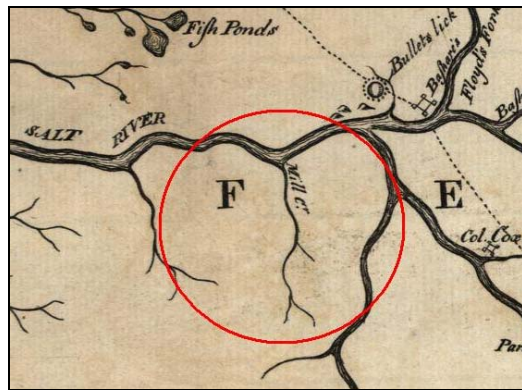
Detail from John Filson’s 1784 map of Kentucky

The National Park Service commemorates Abraham Lincoln’s early life and humble beginnings at Boyhood Home and Birthplace Units at the Abraham Lincoln Birthplace National Historic Site in present day LaRue County, Kentucky. Often overlooked are the Lincoln family’s early roots in the Mill Creek area of Hardin County. Today this area is known as Radcliff/Ft. Knox. This brochure will highlight sites in this area connected to the Lincoln family.