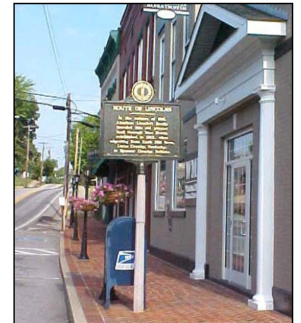
Kentucky Historic Marker in Vine Grove, “Route of Lincolns”

After falling victim to Kentucky’s chaotic land laws and partially due to his views on slavery, Thomas decided to move to Indiana, where he could claim clear title to his land. When Abraham was seven years old, Thomas Lincoln left the Knob Creek farm to make a home in Perry County (now Spencer County), Indiana.