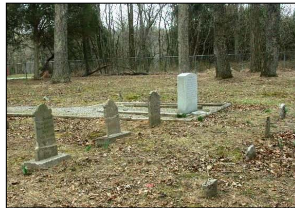
Lincoln Memorial Cemetery on Ft. Knox Visitation is allowed on Memorial Day

① In 1803, Thomas purchased a 238 acre farm which he paid cash and owned until October 1814. The farm is located near the southern boundary of present day Radcliff/Ft. Knox on Battle Training Road, approximately 2 ½ miles from Dixie Highway (31W). Thomas brought his mother, his sister, and her husband to live here.