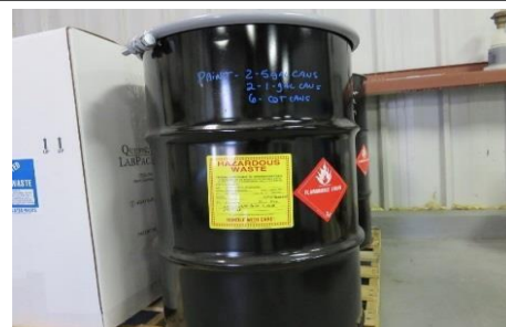
Hazardous Waste Collection Container