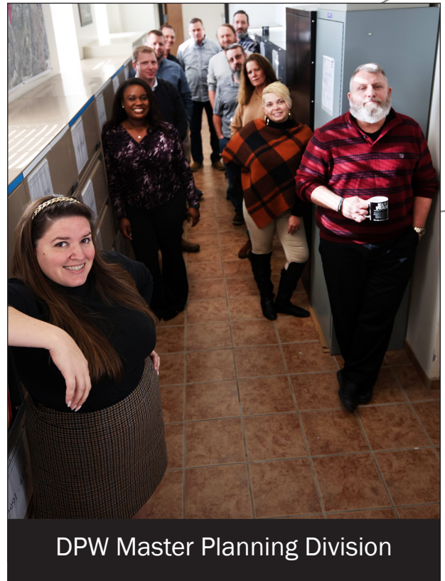
DPW Master Planning Division