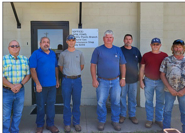
DPW Team Gas Shop

The Gas Shop's work affects all aspects of Fort Knox's mission. The gas lines and components they maintain support 2,382 homes in post housing, and help provide hot meals, heat to barracks and offices, support emergency energy generators, as well as countless other contributions. The team consists of plumbers, certified welders and operators. The team's efficiency and proficiency have led to IMCOM stating it will never privatize this utility at Fort Knox because no one could do it better.