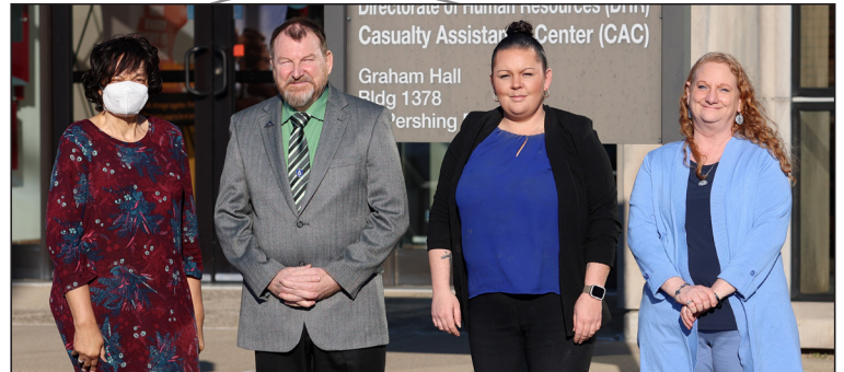
Casualty Assistance Center, DHR

The busiest in the Army, Fort Knox CAC has tracked seven Summary Courts Martial Officer reports with zero reported failures in meeting the 30-day report timeline, ensuring family members received personal effects on time. They have developed creative ways to improve installation programs, including work with county coroners on mass storage capabilities should an emergency occur, which will save the Army over $200,000. Members volunteered over 100 hours last quarter.